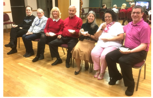
Activity in the small ballroom above