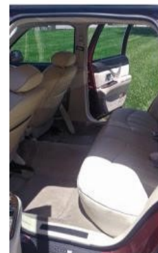
Spacious comfortable seating